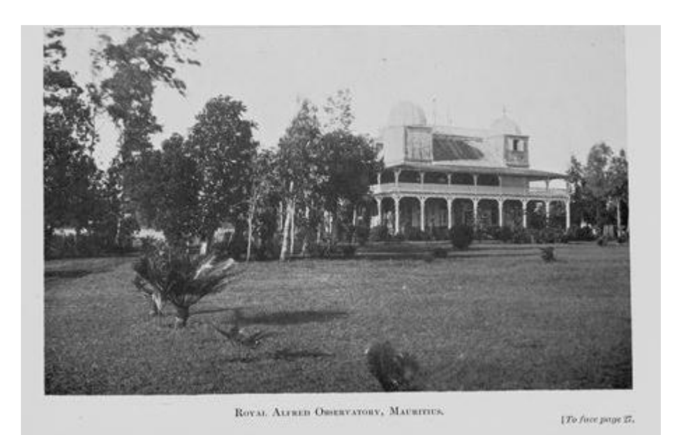
Plate 1: The Royal Alfred Observatory, reproduced with the permission of Bodleian Libraries, University of Oxford, from Walter, A. 1910, The sugar industry of Mauritius , London: A. L. Humphreys (RHO 912 r. 162, plate 5).

The Observatory, in Latitude 20° 5' 39" S. and Longitude 3^{h} 50<sup>m</sup> 12<sup>s</sup> 6 E., is situated on a plain about three miles from the West Coast and stands in eleven acres of Crown Land. The reference mark at the entrance of the Main Building is 178.1 feet above sea level.